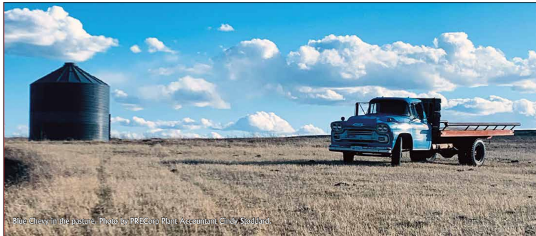
Blue Chevy in the pasture.

You can still pick up a free 2022 PRECorp Calendar - while supplies last - at our offices in Sundance or Gillette. The calendars feature the photographic talent of PRECorp employees and the natural beauty of northeast Wyoming.