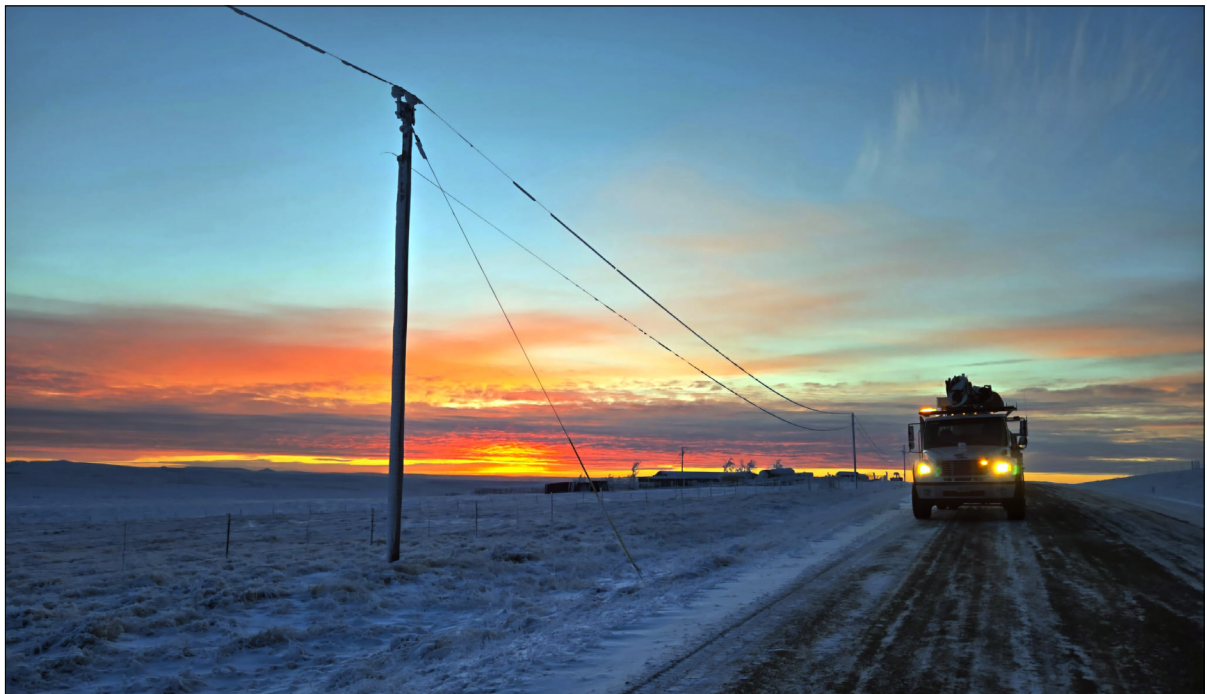
Early morning maintenance work near Wright, Wyoming.