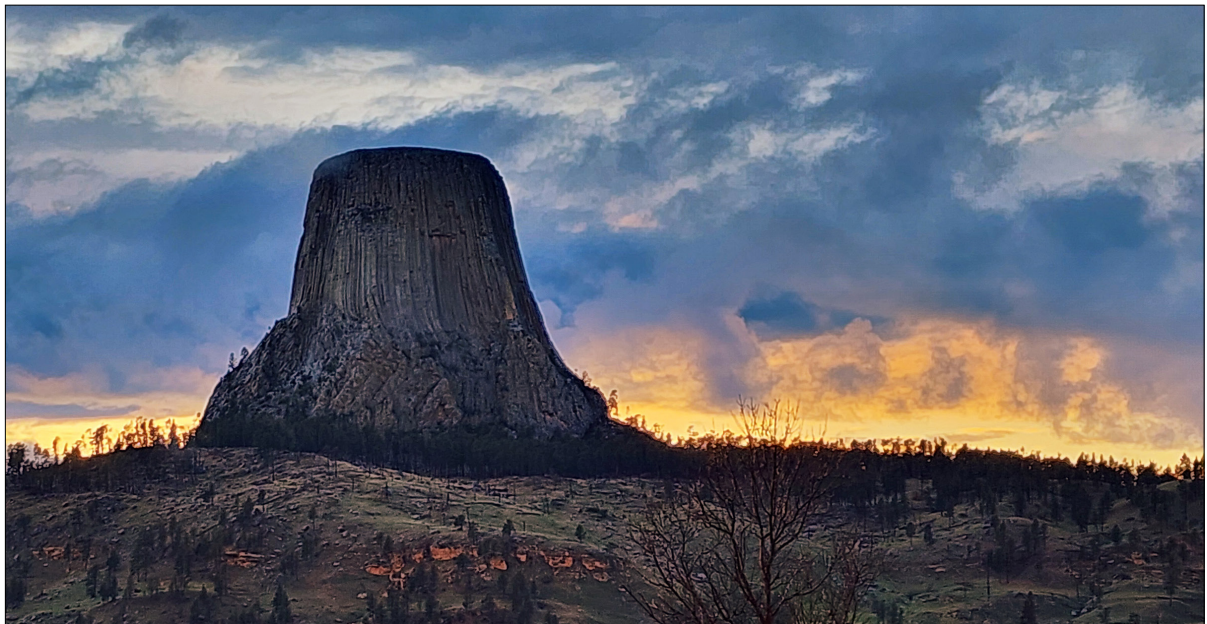
Evening sunset behind Devils Tower, Wyoming.