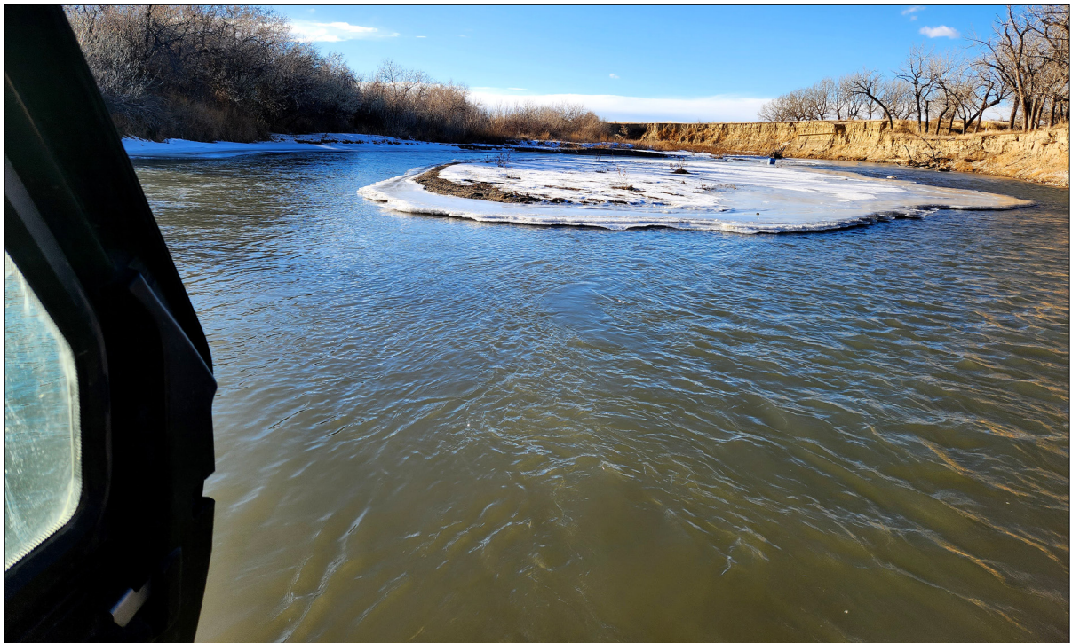
Ice breakup on the Powder River.