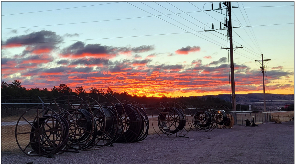
Sunrise at the Newcastle Operations Outpost.