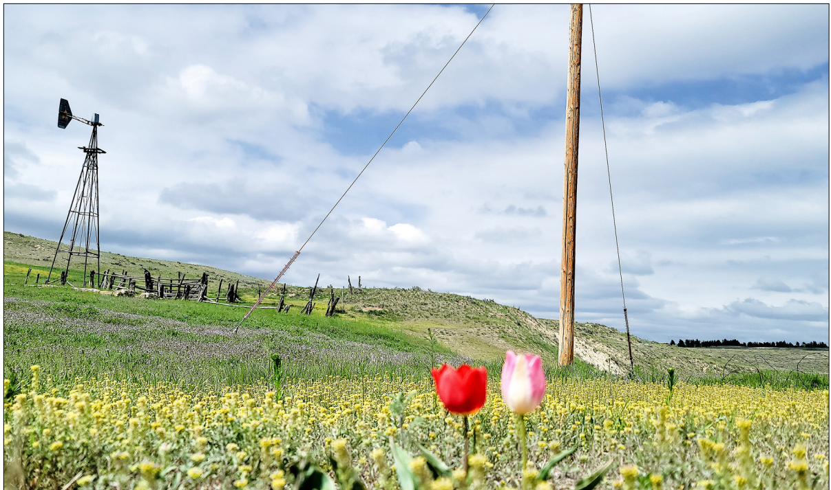
Tulips remain on an old homestead in Sheridan County.