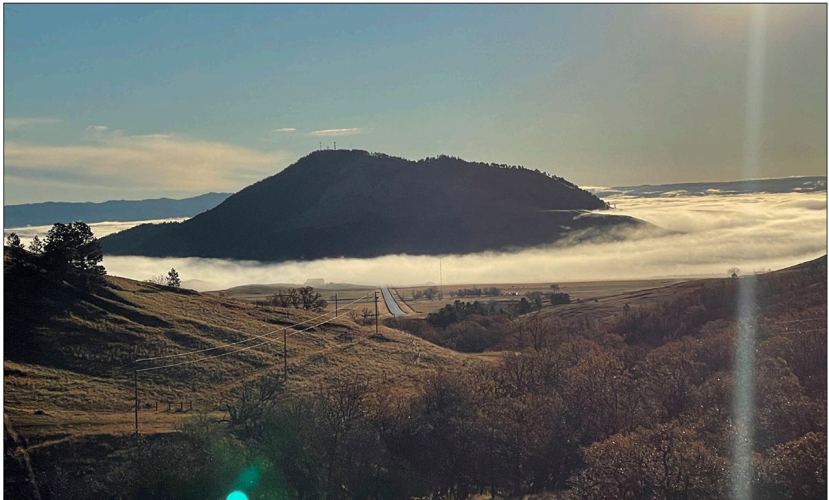
Sundance Mountain above the fog.