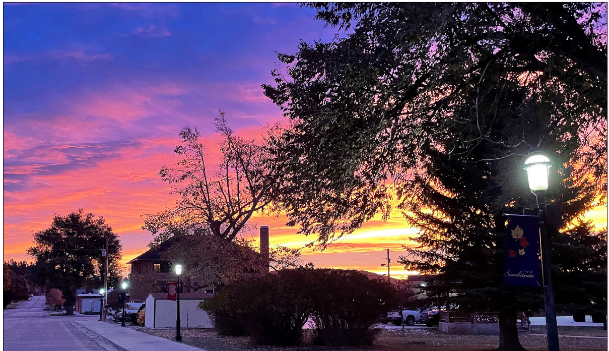
Sunset in the morning light.

Tuesday, September 19, in Sheridan. The 78 th Annual Membership Meeting will be held at 10:30 a.m. Saturday, August 26, at Buffalo High School.