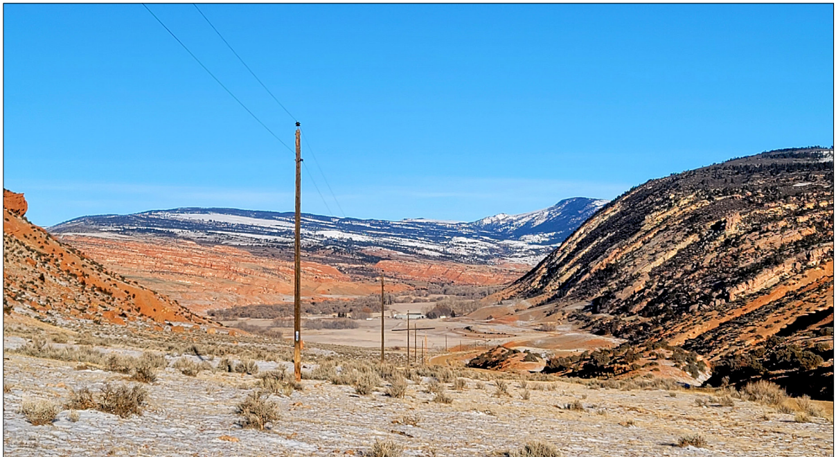
Serving a ranch near Kaycee and Barnum.