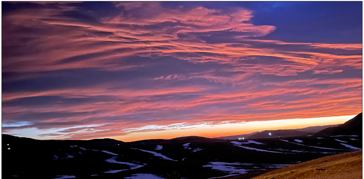
Rural lights in northeast Wyoming.