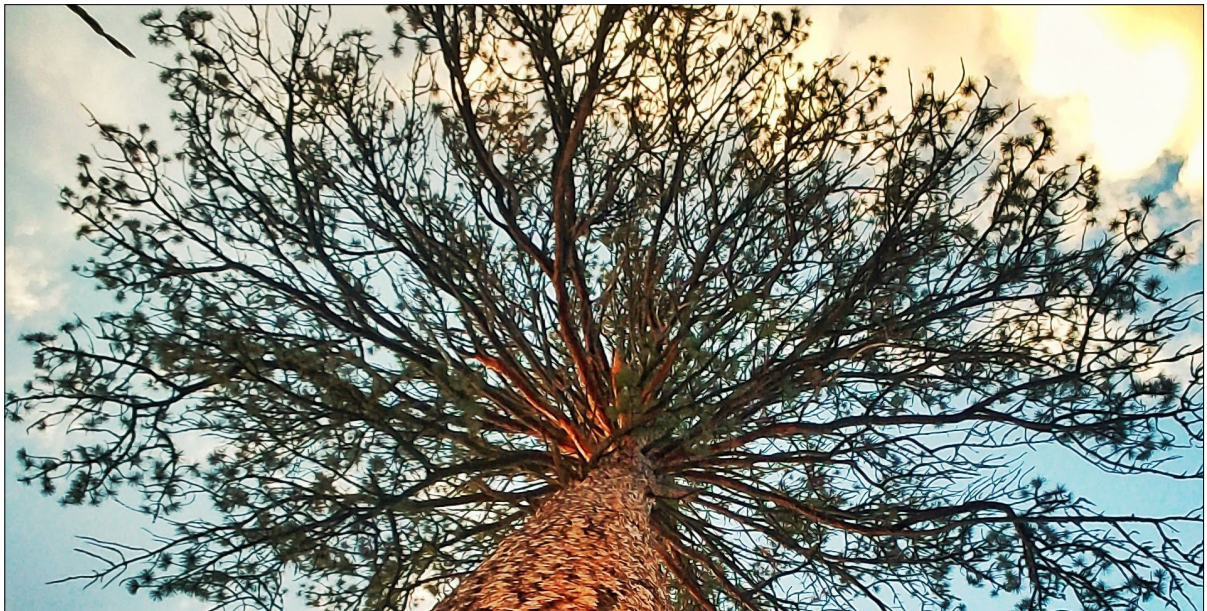
Ponderosa Pine in the Bear Lodge.