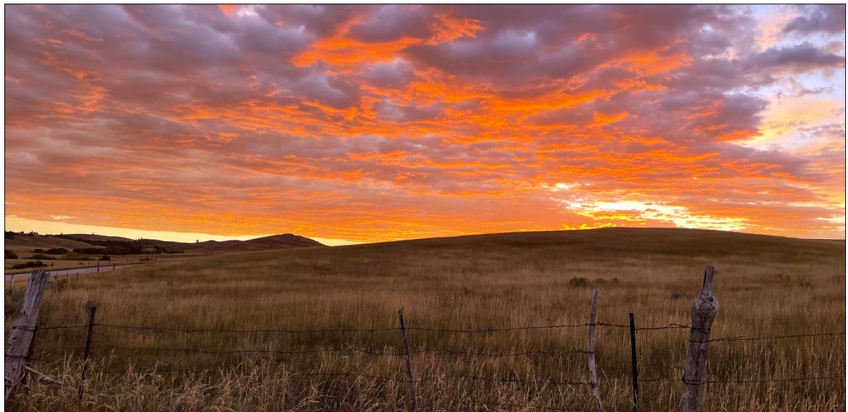
Sunset on the prairie in Powder River territory.